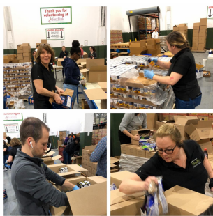
Health Foundation staff pack boxes of emergency food.

(READ: Rochester community bands together during pandemic )